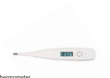
Oral Digital 30 Second Thermometer This reliable oral thermometer for kids and adults has been clinically tested for both speed and accuracy. Rigid Tip, fast 30 second read, waterproof and last reading recall. 12.2 x 1.8 x 1.1 cm ..... 1020118