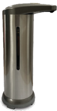
Table Top Dispenser Includes infrared sensor for fully automatic non-touch operation. Effectively avoid germs or infection without making physical contact with dispenser. Works with most bulk Liquid/Gel Hand Sanitizer. 280mL Capacity refills. Battery Type—AAA, 4x - batteries required. (Batteries not included). On & Off button and waterproof. Dispenser material: Stainless steel shell, Nylon inner shell. ..... 1037481

Automatic Hands-Free Wall Mount Sanitizer Dispenser Dispenser works with most liquid/gel hand sanitizers making them ideal for use in offices, schools, warehouses, food services facilities, hospitals and more. ADA Compliant in force and one-handed operation, making it accessible to people with disabilities. ABS plastic casing is chemical, heat and impact resistant, made to provide long service life. Drip tray included. Black ..... 1037482 White ..... 1037483